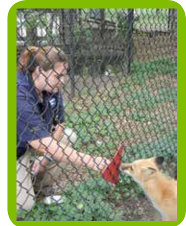
Red fox learning shape discrimination.

Training a new behavior can be very challenging depending on the species and the individual personality of the animal we are working with. Training is 100% voluntary on the animal’s