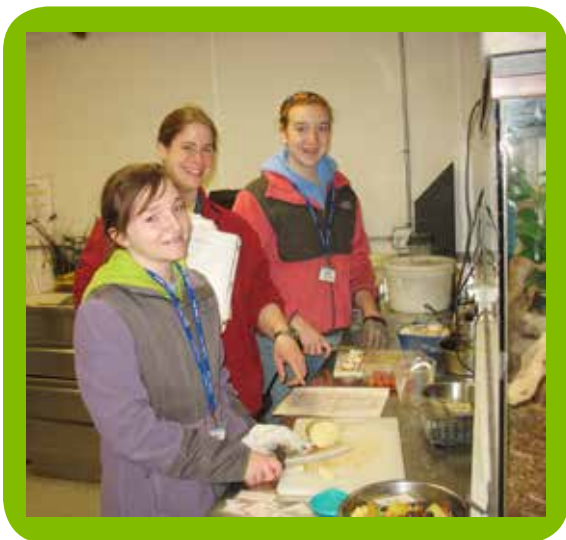
Teens Lend a Hand

We look forward to seeing you at the zoo!