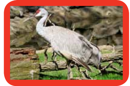
Ichabod, the zoo's Sandhill Crane.

While migration is a natural instinct, biologists are concerned about the effects of habitat loss and change on this phenomenon. Flyway managers have identified specific factors that may disrupt flight patterns. These include urbanization, pollution, and climate change. The health of many wetland ecosystems, is often measured by the amount of migrating populations that visit. Even with habitat protection over time migrating birds may have to adapt to new environments for stopovers, breeding areas, and flight distances. These changes in the flyways will be like adding road construction in the sky. I just hope that the birds don't encounter too many traffic jams in the process!