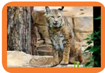
Once a threatened species, Bobcats now thrive thanks in part to AZA zoos like Cosley Zoo.

A few great educational experiences at Cosley Zoo include our summer camps for kids, outreach programs for schools and scout groups, and Bobcats Backstage, where you can go behind-the-scenes to visit the bobcats and learn about their care.