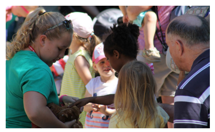
Cosley Zoo members help support interactive education opportunities, such as this Junior Zookeeper Animal Encounter.

But our institution-wide commitment to conservation doesn't end with frogs and toads.