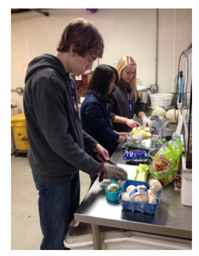
JZs help with animal diet preparation.

"The most enjoyable thing about the program is talking with the other Junior Zookeepers because they